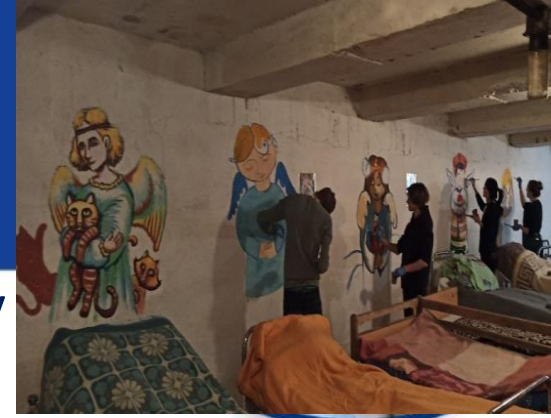
Students of culture and arts faculty painting classes at the shelter...