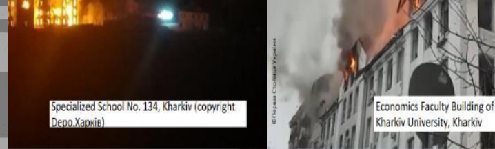
Specialized School No. 134, Kharkiv